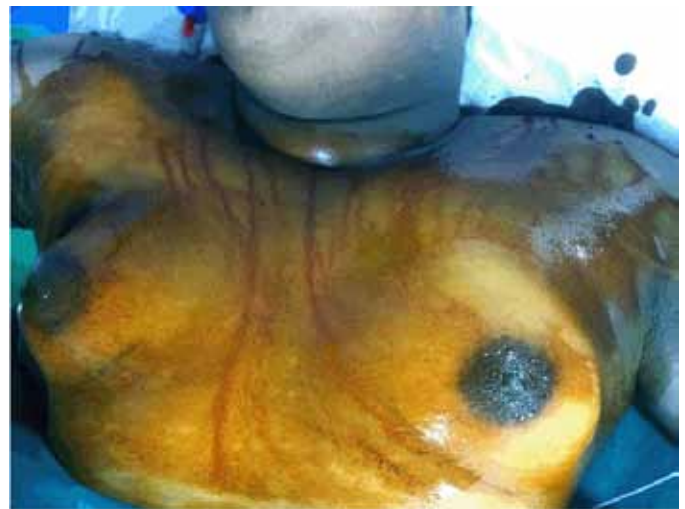
Figure 2: Preoperative picture of bilateral giant gynecomastia.