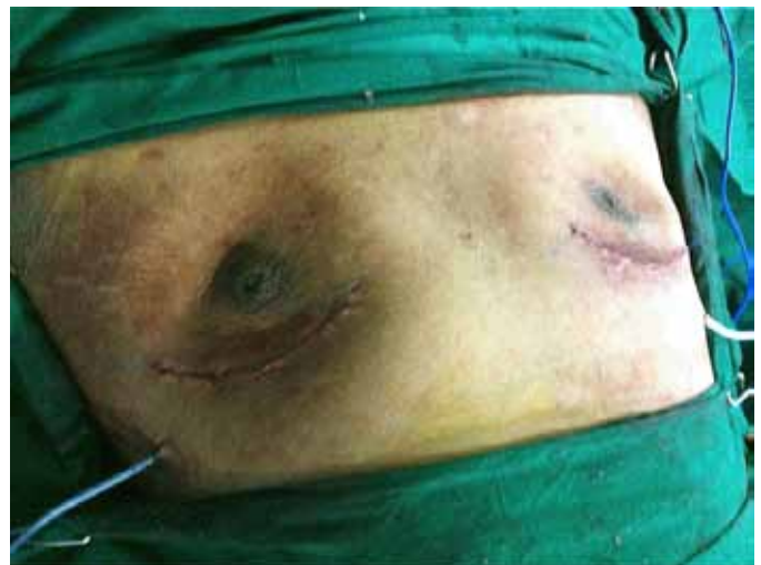
Figure 3: Postoperative picture with the drains in situ.

Etiology wise, in primary hypogonadism, there is decreased synthesis of testosterone and increased peripheral conversion to estradiol, which leads to gynecomastia. In Klinefelter syndrome, which is