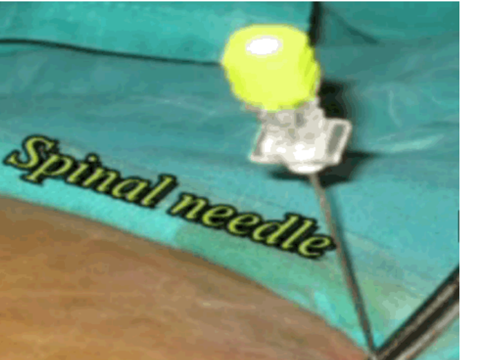
Figure 3: The spinal needle fixed on the abdominal wall by an artery forceps.

Edorium J Surg 2017;4:18–22. www.edoriumjournalofsurgery.com