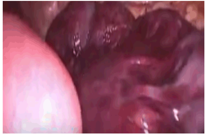
Figure 3: Gangrenous loop of intestine captured by the mobile endoscope during the second look.