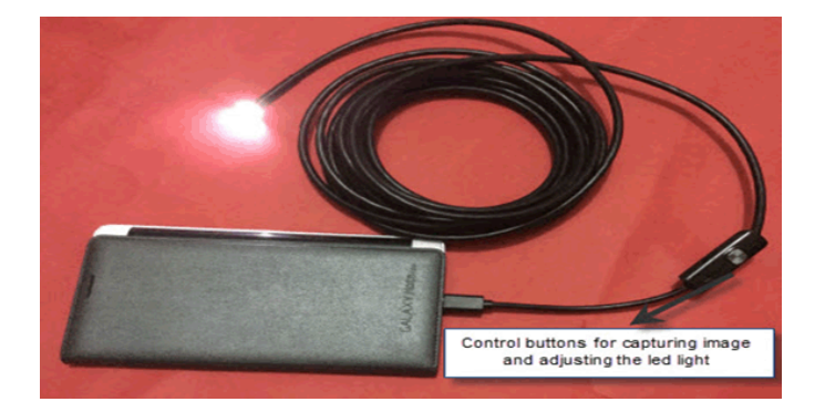
Figure 1: The used endoscope connected to an android cell phone.

In our emergency department, our strategy is to do a second-look for all patients explored for MVO especially if bowel resection and anastomosis was performed. We did an endoscopic assisted second-look examination under sedation within 72 hours after the 1st operation at the bed side in the ICU or in the operating room under complete aseptic conditions. At the end of the 1st operation, in addition to the usually used drains a 24-fr nelaton rectal tube was inserted and fixed into the left lower quadrant of the abdomen prior to closing the abdominal wall. The rectal tube was cut near the blunt end to make it like a soft port through which we accessed the peritoneal cavity using our USB endoscope (Figure 1) (Dower me, AD-14-5M) (5.5 mm diameter, 5 meters length, 60° 2 mega pixels camera with six adjustable small led spots,